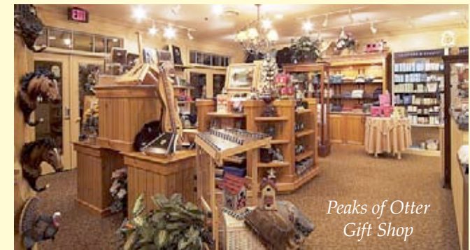
Peaks of Otter Gift Shop