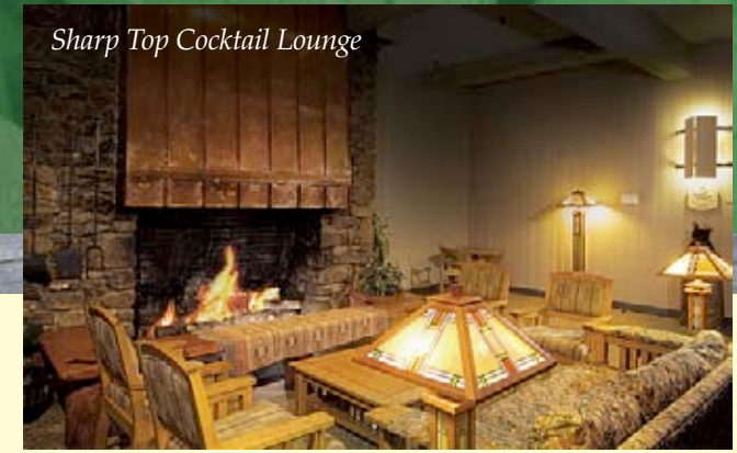
Sharp Top Cocktail Lounge

Lodge facilities include 48 double, 12 king and 3 ADA rooms. This is truly the ultimate get away, where you can escape the everyday and enjoy a calm serenity created by the unapologetic absence of phones or televisions in the rooms.