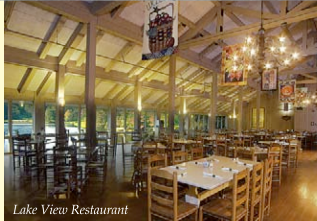
Lake View Restaurant

Lodge facilities include 48 double, 12 king and 3 ADA rooms. This is truly the ultimate get away, where you can escape the everyday and enjoy a calm serenity created by the unapologetic absence of phones or televisions in the rooms.